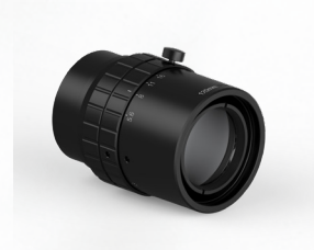
Line Scan Lens