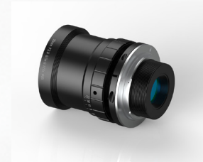
Large Format Lens